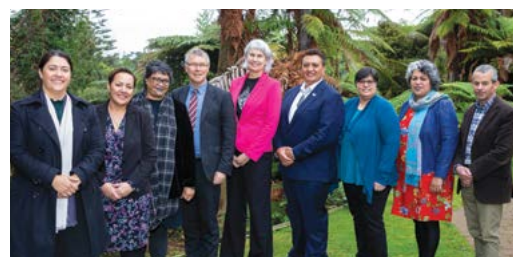
Waikato River Authority board members with Hon. David Parker, Minister for the Environment.

The Minister gave special tribute to the work of the Authority's previous board and to the on-going commitment of the current Waikato River Authority.