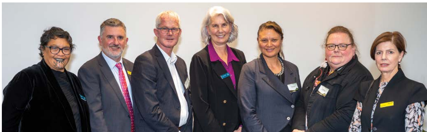
Speakers from the Leaders' Water Forum held in Hamilton at the end of May.

summarised by saying the Waikato River has borne a burden of use and at times mis-use over many decades, and that we must make progress on the journey for the wellbeing of the river.